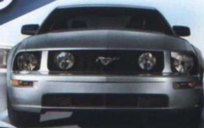
2009 GT, 4.6L 3V V8, 300 HP

In 2009, America celebrates 45 years of Mustang, carrying on a tradition started in 1964 — a tradition that celebrates the automobile, the freedom it gives and the joy of driving.