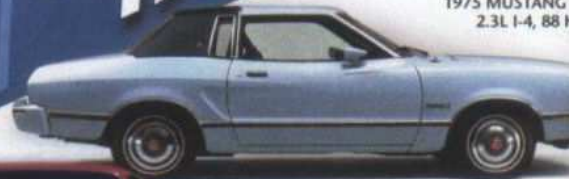
1975 MUSTANG 2.3L I-4, 88 HP

1974 saw two things that didn't bode well for those who loved their cars — the nation's first gas crisis had begun and the downsizing of the Mustang occurred. The redesign was, in part, a response to the gas shortage and the beginning of the emissions era.