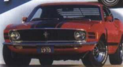
1970 BOSS 302, 302 V8, 290 HP