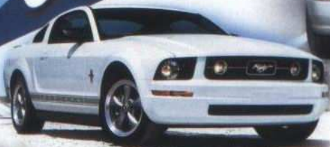
2007 V6 PONY PACKAGE, 4.0L V6, 210 HP

2005 quickened the pulse of every automotive devotee (not to mention most of the American public) as the latest-generation Mustang had throwback styling married with the latest in advanced performance technology. The result was a hot rod of incomparable value.