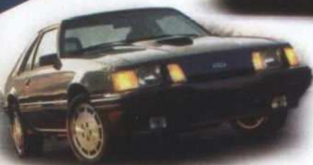
1986 SVO, 2.3L I-4 TURBO, 200 HP

It was 1979 when the next generation of Mustang, the "Fox" platform, began to work true muscle back into the equation. The design was a success and in 1993, its final year, an impressive 114,228 units rolled off the showroom floors — an outstanding testament to the popularity of its overall design and platform.