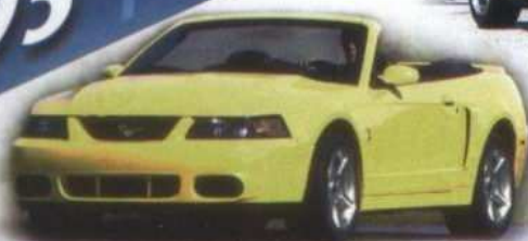
2003 COBRA, SUPERCHARGED 4.6L V8, 309 HP

It was 1979 when the next generation of Mustang, the "Fox" platform, began to work true muscle back into the equation. The design was a success and in 1993, its final year, an impressive 114,228 units rolled off the showroom floors — an outstanding testament to the popularity of its overall design and platform.