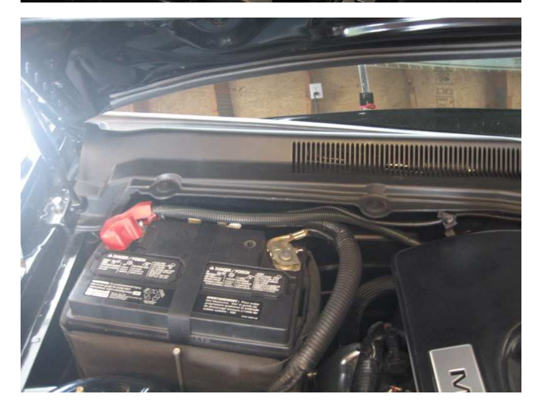
Installation complete. Enjoy your new fresh cabin air!